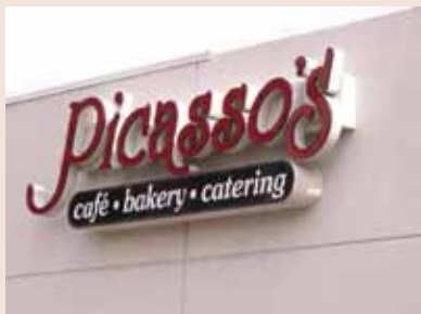
Gift cards to benefit Clinics