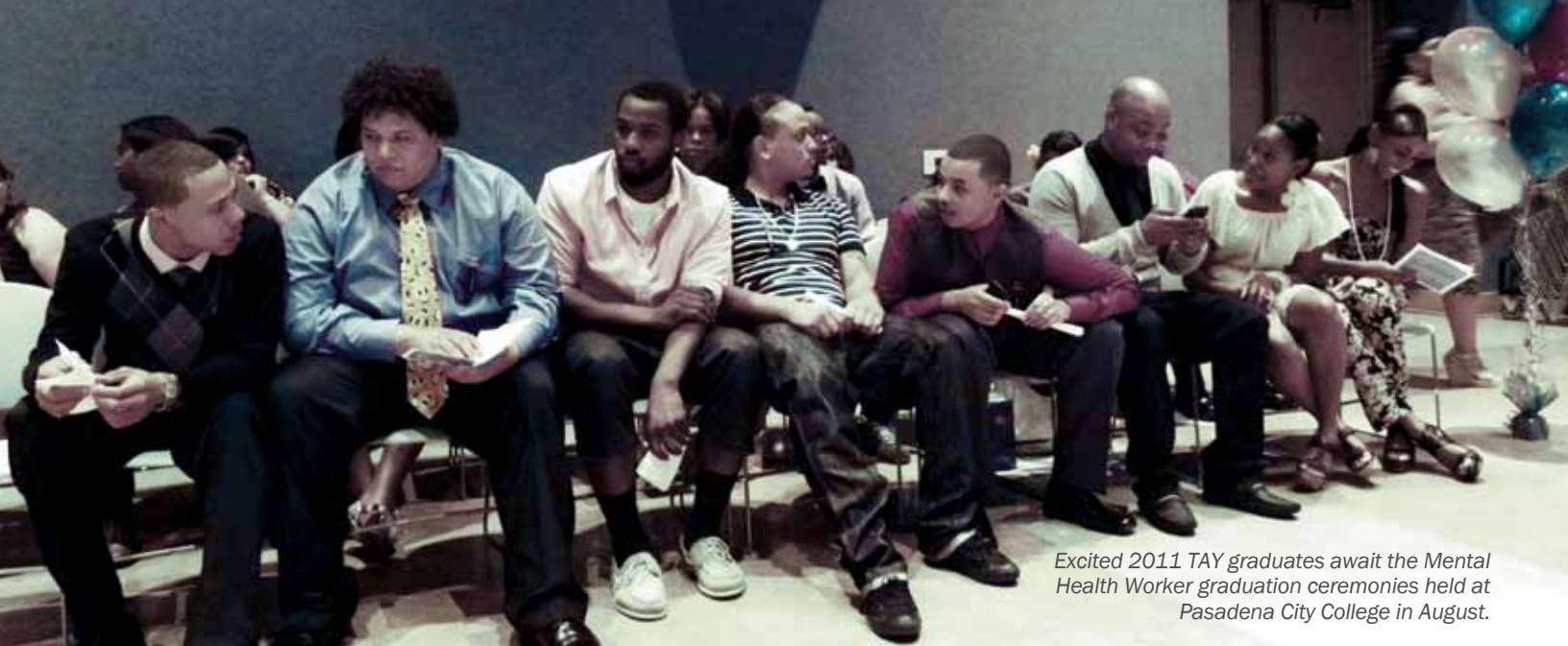
Excited 2011 TAY graduates await the Mental Health Worker graduation ceremonies held at Pasadena City College in August.