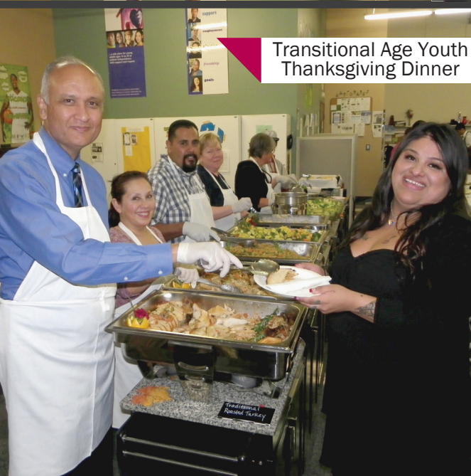
Transitional Age Youth Thanksgiving Dinner