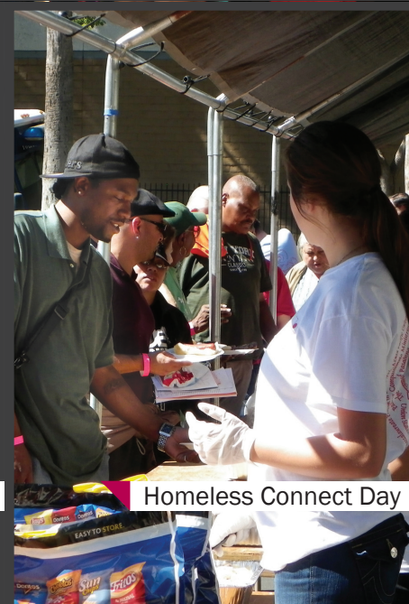
Homeless Connect Day