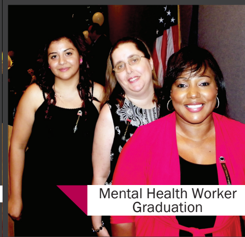
Mental Health Worker Graduation