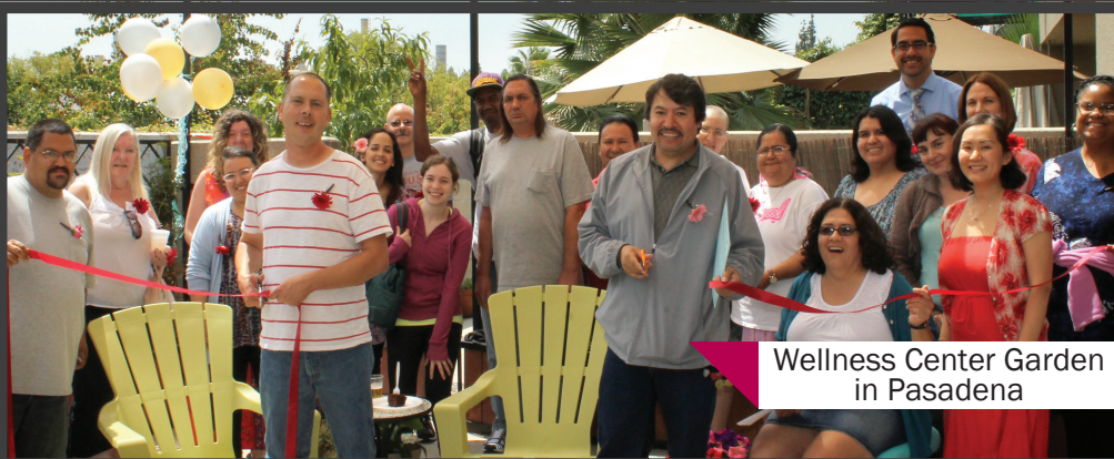
Wellness Center Garden in Pasadena