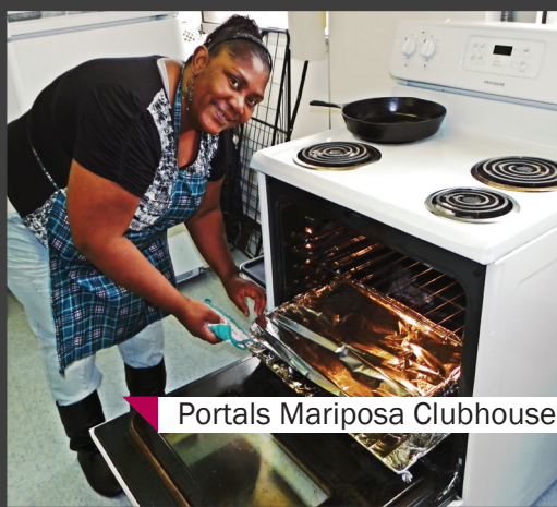
Portals Mariposa Clubhouse