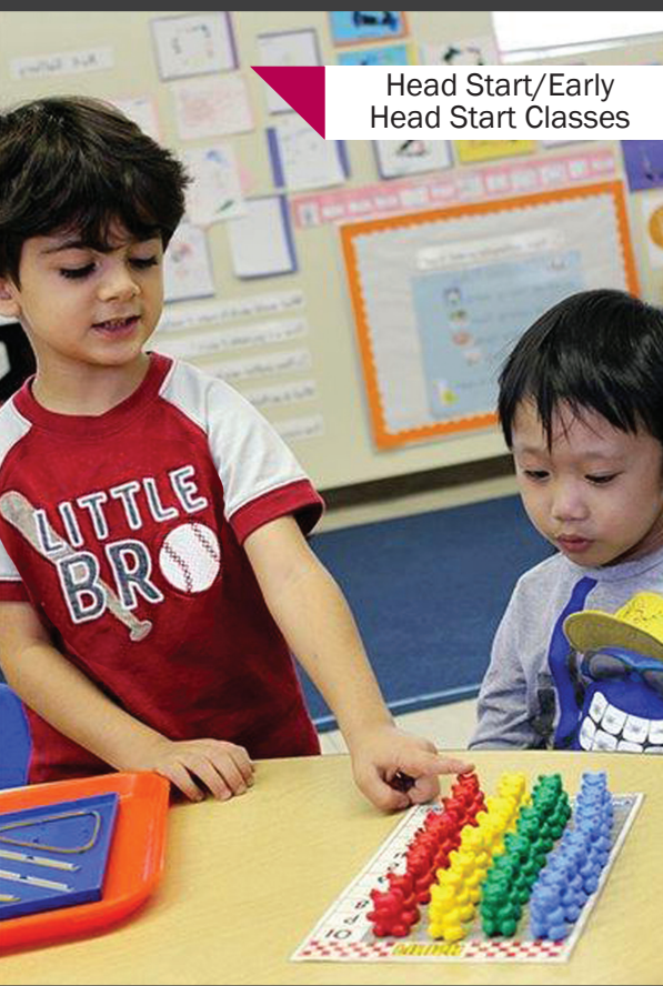
Head Start/Early Head Start Classes

Pioneering programs continue to provide a path to wellness