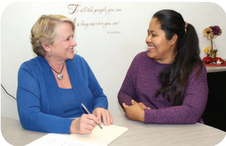
Whittier school-based program staff meet clients and their families for counseling services.