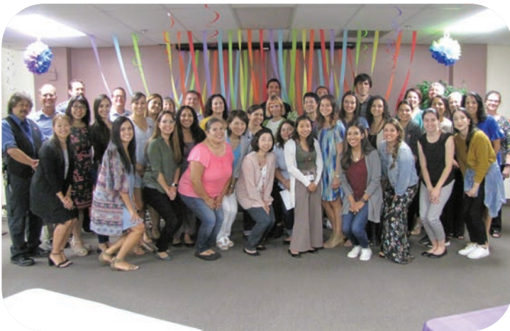
Staff celebrated newly licensed clinicians through the Clinician Pathways Program offered to new Pacific Clinics employees.