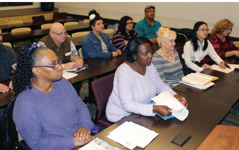
REI Students in Classroom

More than 37% of students with a mental illness drop out of school, according to national mental health statistics – making this the highest dropout rate of any group. As these students grow older, it becomes increasingly difficult to obtain and maintain employment or go back to school to complete their high school degree or GED.