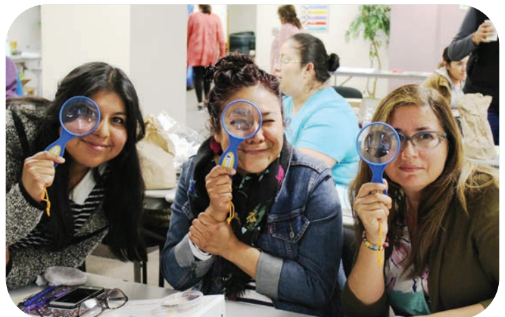
Head Start/Early Head Start educators learn how to incorporate STEM in classrooms.