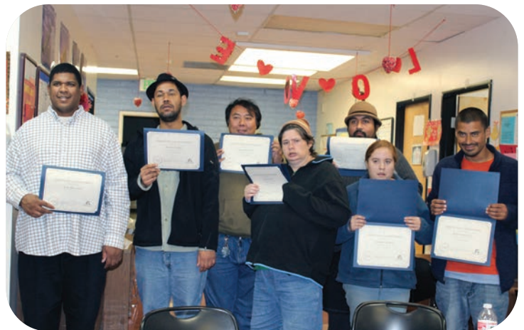
Clients from the El Monte program graduate to a lower level of care.