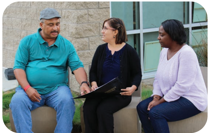
REI staff can be found around campus making it a welcoming environment for students.