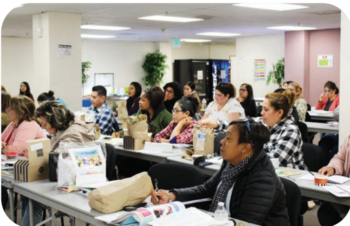
Pacific Clinics Training Institute provides hundreds of trainings throughout the year to staff and community partners.