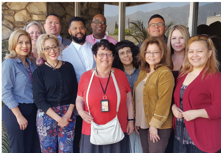
The Maximus Foundation site visit

Pacific Clinics was one of four awardees statewide to receive an Office of Statewide Health Planning & Development (OSHPD) grant. The three-year, $1,050,000 renewal grant will support the Psychiatric Mental Health Nurse Practitioner Preceptorship Internship Program at Pacific Clinics, which offers students a broad scope of recovery-focused placement opportunities and experience in the public mental health system. We are partnering with several schools to offer 32 preceptorship placements.