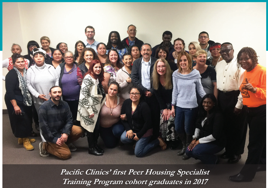
Pacific Clinics' first Peer Housing Specialist Training Program cohort graduates in 2017

For more information on trainings, visit www.mypcti.org ■